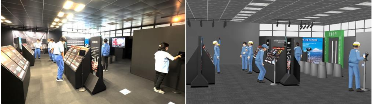
Safety Promotion Center, left, Metaverse Safety Promotion Center (1)

*Metaverse: A virtual-reality space where avatars can freely interact