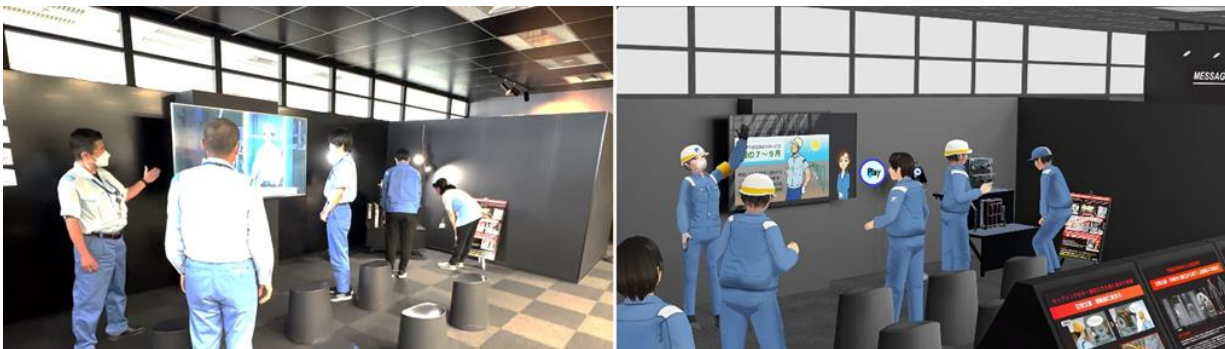
Safety Promotion Center, left, Metaverse Safety Promotion Center (2)