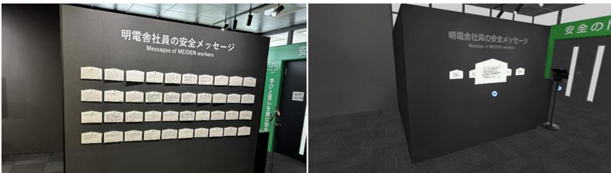
Tablets on which Meiden Group employees write safety pledges are displayed