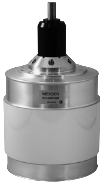
Fig. 1 VP150 Type

This is our largest vacuum capacitor with an external diameter of 150mm \phi and a total length of 265mm. It is estimated to carry 400Arms. The exposed part of middle section of copper has a port for water cooling.