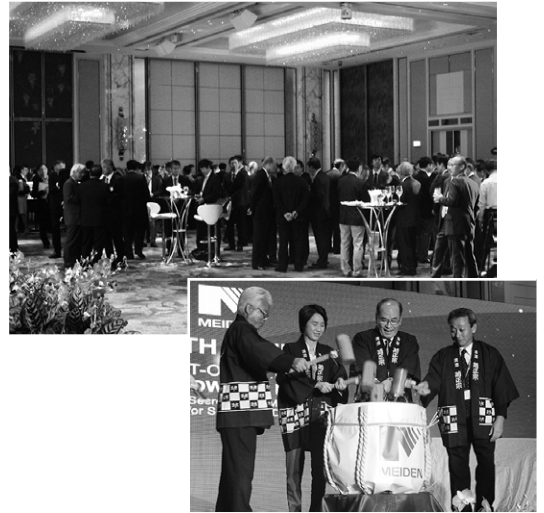
40th Anniversary Ceremony

Plan by Singapore Government and work hard to spread the application of ceramic MBR to ASEAN and Middle East Regions.