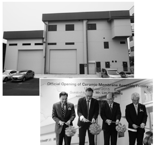
Ceramic Membrane Units Factory and Opening Ceremony