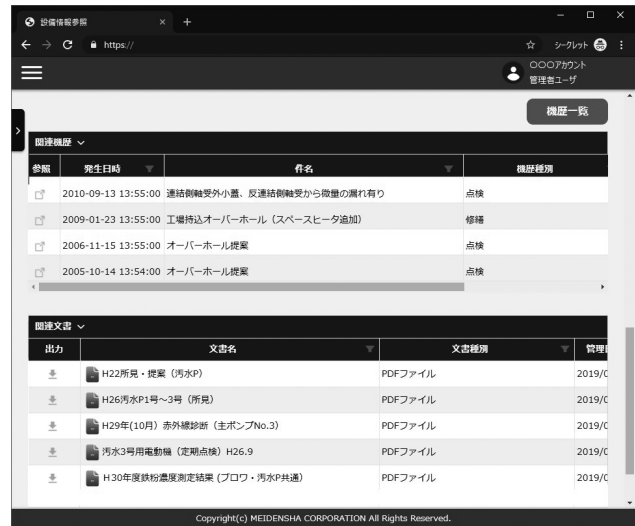
(b) Lower part