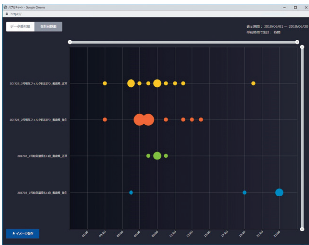
Fig. 3 Bubble Chart The number of times of events occurring in a specified period is shown in a bubble chart in circle sizes and occurring time.

event is unevenly distributed to a specific day of the week or time zone can be visually grasped. Fig. 2 shows a pie chart and Fig. 3 shows a bubble chart.