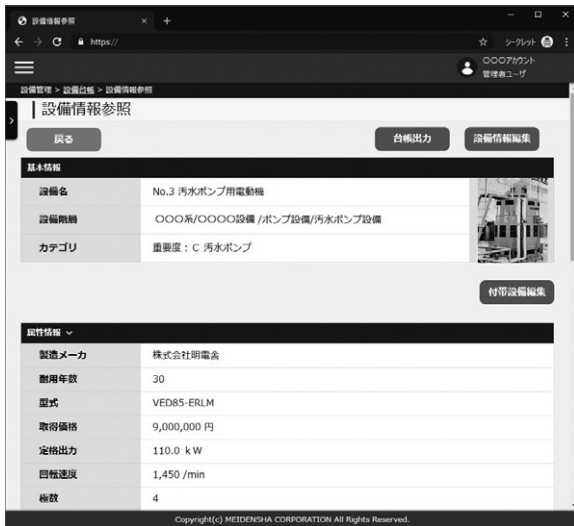
(a) Upper part